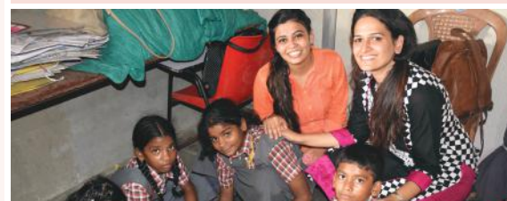
Socially Responsible Entrepreneurs