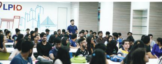
World Class Infrastructure

Marketing Strategies, Digital & Social Media Marketing, Communication & Technology, Public Relations and Media Plans